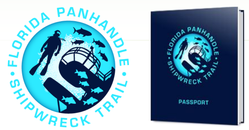
Look for the official trail logo at participating businesses to pick up your Passport!

Launched last month, the Florida Panhandle Shipwreck Trail consists of 12 unique and historic shipwrecks, all of which are protected by law. Many of the sites were sunk as artificial reefs and have become popular fishing and diving destinations off the shores of Pensacola, Destin, Panama City, and Port St. Joe. They are located in varying depths of water and are home to a wide array of marine life.